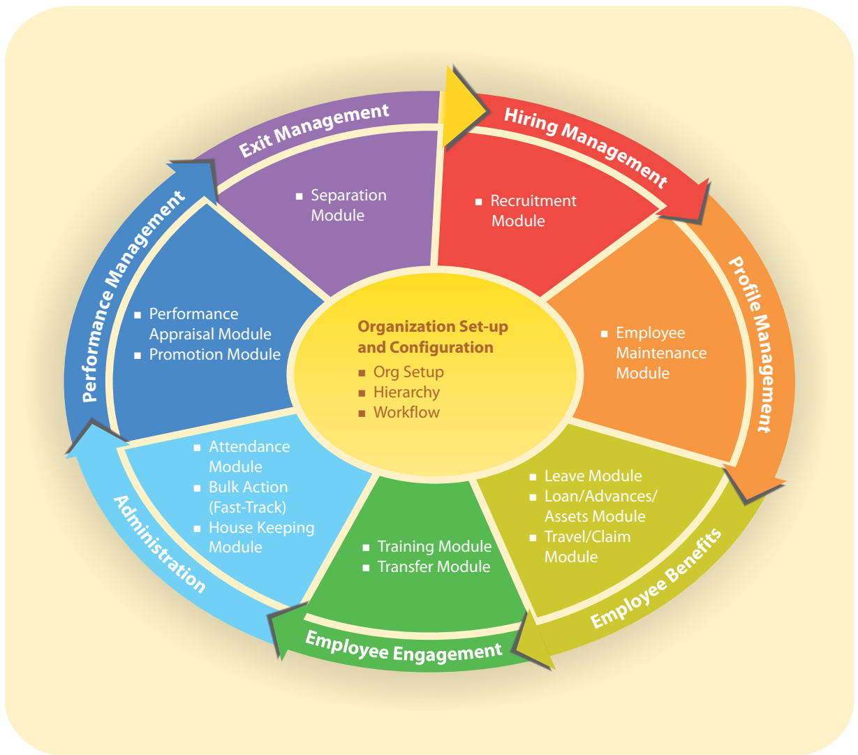
An overview of the iON Human Resources Management Solution (HRMS)